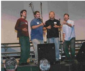
Four Way Stop Impresses the Students