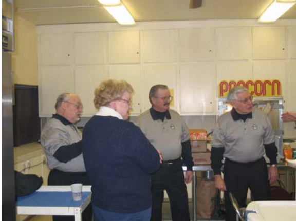
Working in the Kitchen