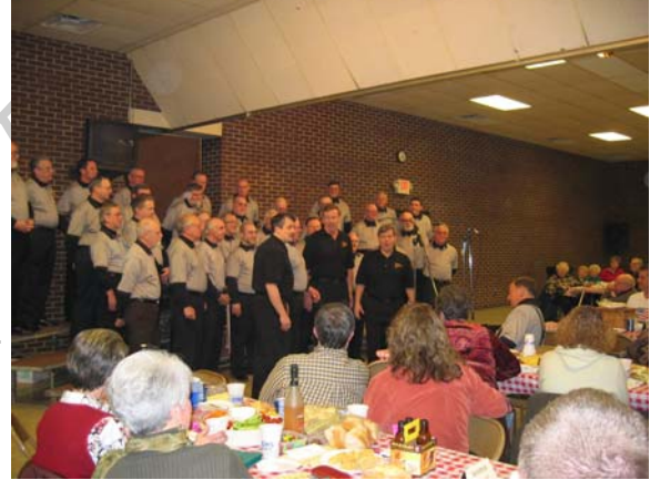
Harmony Supply Line and HOF