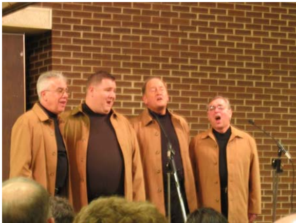
Twilight Schmoozing the Audience