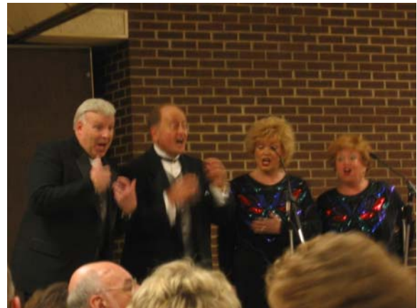
Guys and Dolls Hamming it up