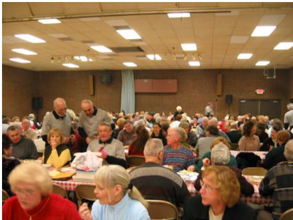
Nearly Sell Out Crowd