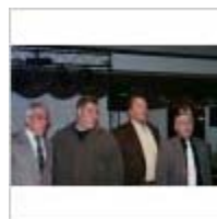
Twilight performing at the BOTY.

If this year's BOTY banquet and celebration was any indication of things to come, this will be an exciting year for the Canton Chapter! Our new CD, our new director, and all the fantastic performances in the past year have given us the momentum to burst into 2004 and make it the best year the Hall of Fame Chorus has ever had! Join us in our great barbershop journey!