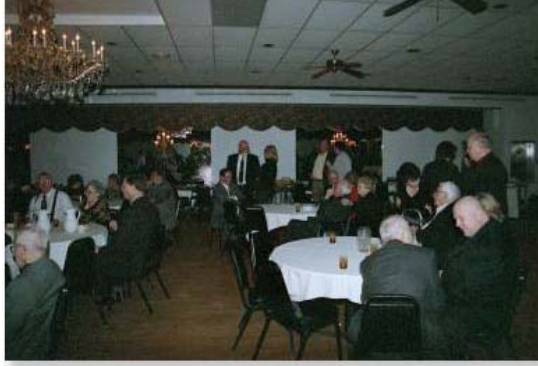
Some Party go-ers at the BOTY