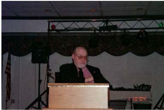
Out-going BOTY present plaque to 2003 BOTY